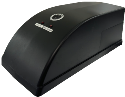
Crathco Autofill Lid Puts a Lid on Labor