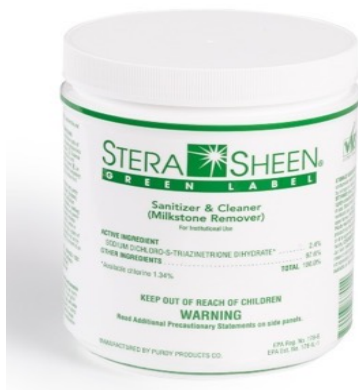
LV9R0195 2/4 lb. Stera-Sheen Green Label Jars